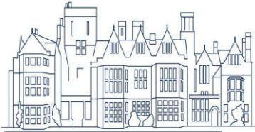
HATHEROP CASTLE SCHOOL